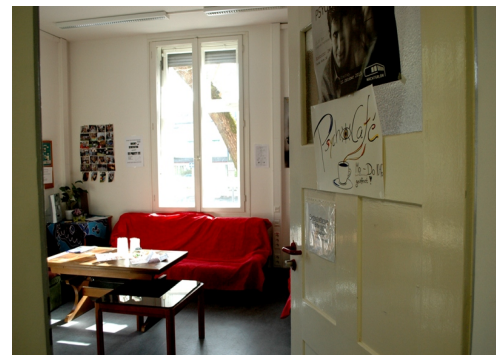
Figure 1. Psycho-Café

The student council of the Department of Psychology, the so called “Fachschaft”, serves as contact and representation for the students of the department and their interests. The Fachschaft puts together an orientation for new students of the department at the start of each fall semester. It also organizes the annual Summer and Christmas parties, and the “Psycho Film Series” (Psycho-Kino), where films with a psychological background can