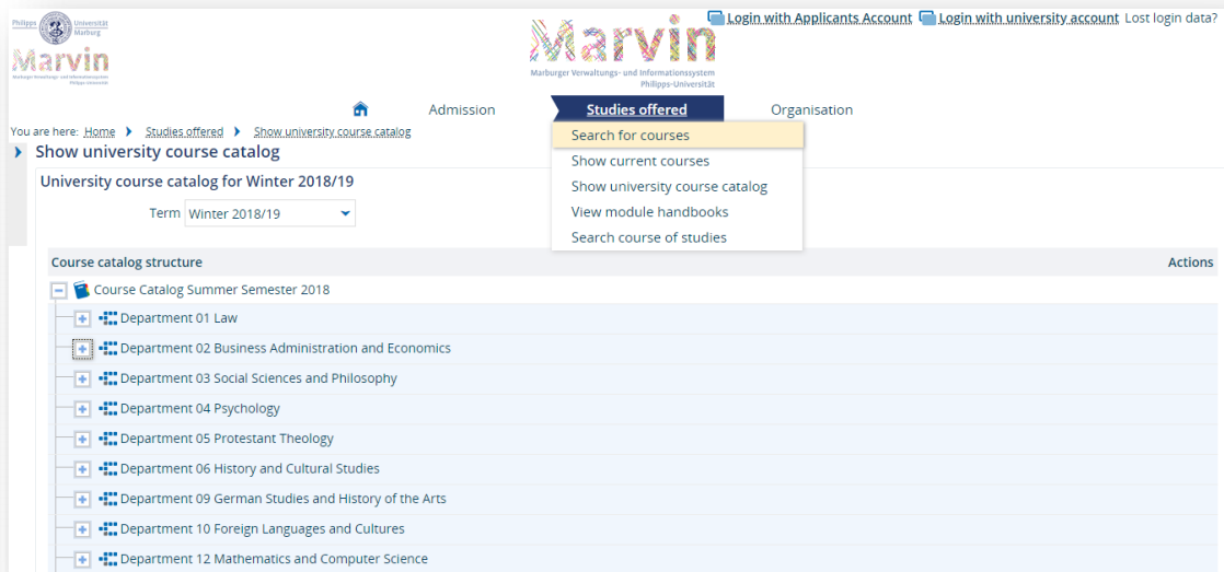
Figure 4: Course Catalog and Navigation to Search for courses